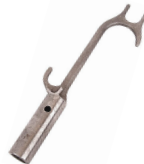
WIRE RAISING TOOL